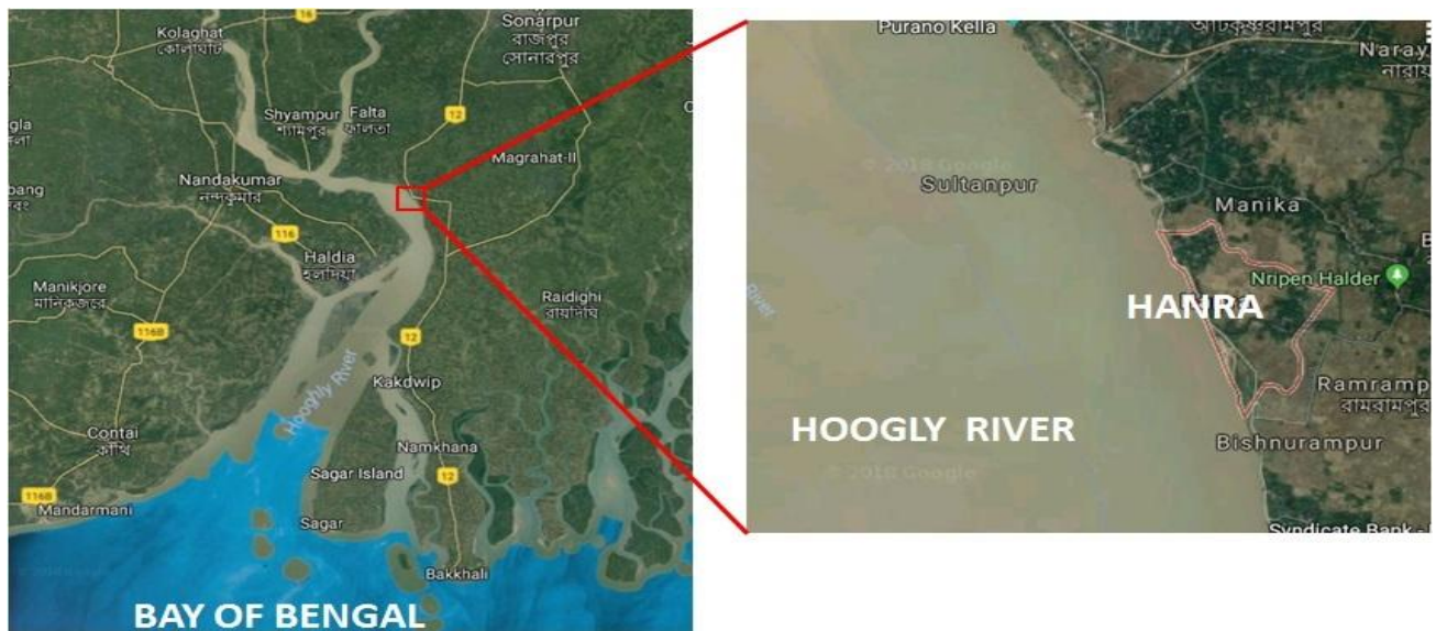
Fig.1: Map of specimen collection site (modified image from google maps)

Fresh fish samples were identified and collected from the site over a period of six months (August 2017 to February 2018). Fresh samples were carried in ice to the laboratory without any physical damage. The morphometric measurements were taken using Scale and Vernier caliper. The fish were weighed by a digital balance. All the measurements were made on the left side of the fish.