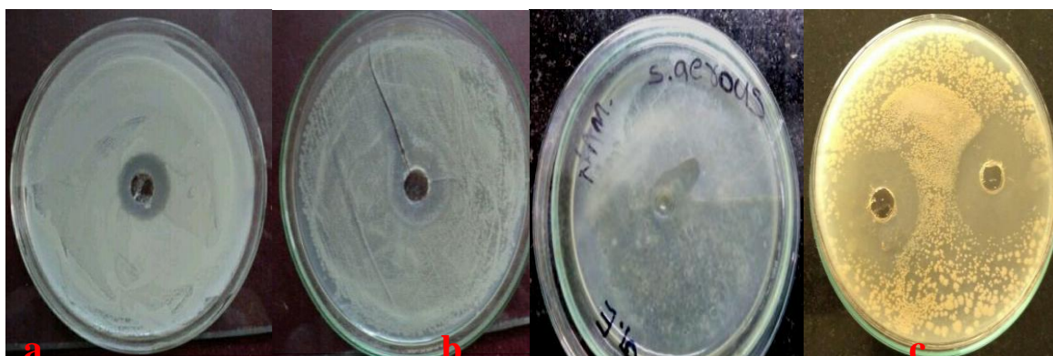
Plate.2. Antibacterial activity of parotoid gland extract against a. E. coli . b. K.