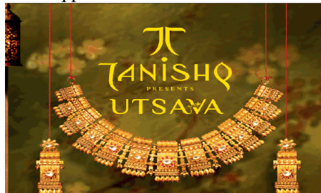
[Advertisement of jewelry – Accessed from www.advertgallery.com]

3.] Noun Phrase where a word or group of words containing a noun and functioning in a sentence as subject, object, or prepositional object.