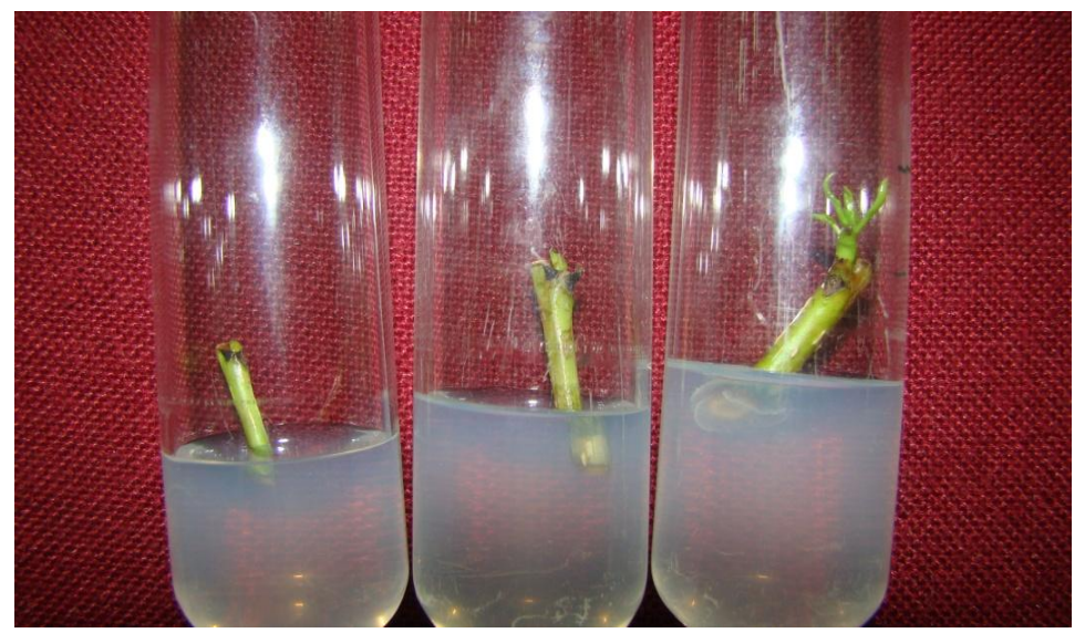
Fig 1: Initiation of Populus nigra after 21 days.